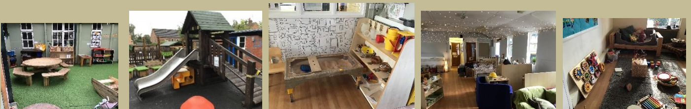
Photos of our new setting will be posted when we have finished our transition in November

We are an ELKLAN Level 4 Communication Friendly Setting, and we are proud to be part of the Early Talk for York approach, working at Step 3. We have recently been awarded the National Autistic Society's Specialist Setting Award, advanced level.